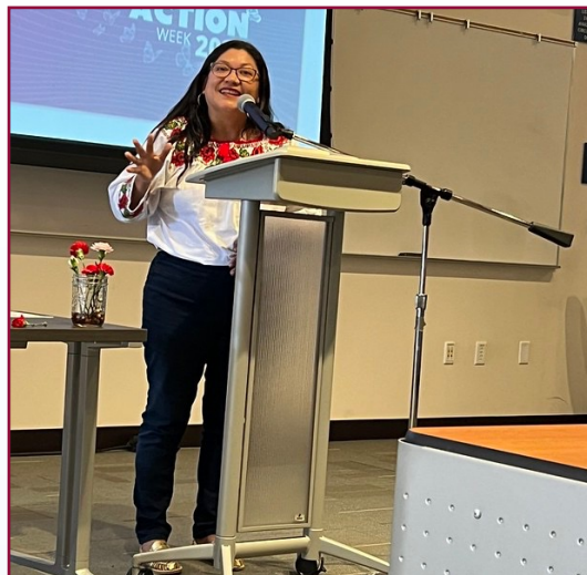
Photo: Author Reyna Grande addresses the Contra Costa College Community

Award-winning author Reyna Grande visited Contra Costa College on Monday October 17 th to speak about her memoirs, The Distance Between Us and A Dream Called Home , which recounted her journey from an undocumented child immigrant to becoming a U.S. citizen. She did not originally envision her writing as a tool for social change, but a way for her to transform her trauma. Now she thinks about how her stories can change the world and hopes they'll help create a dialogue about undocumented experiences.